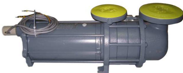
Hermetic pump CAMR 2/3