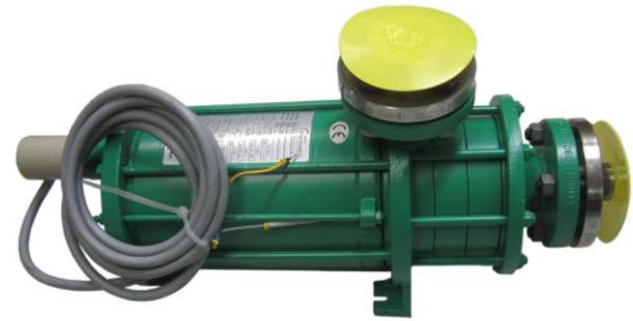
Hermetic pump CAM 1/3

Operating range: Capacity Q: max. 35 m 3 /h Head H: max. 130 m.c.l.