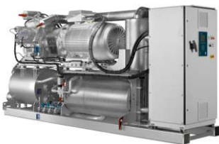
SABROE HeatPAC heat pumps, 300–2000 kW