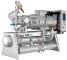
SABROE SABflex screw compressor units, 160-950 m3/h