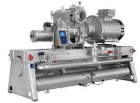
SABROE Sab screw compressor units, 850-11000 m3/h