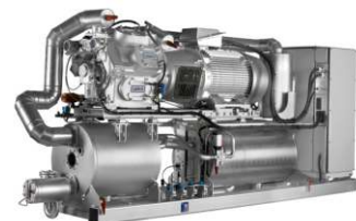
Single-stage high-pressure SABROE HeatPAC HPX heat pumps, 326–1300 kW