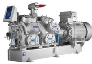
SABROE SMC reciprocating compressor units, 200-1350 m3/h