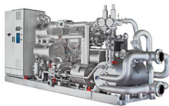
SABROE HeatPAC heat pumps, up to 1800 kW