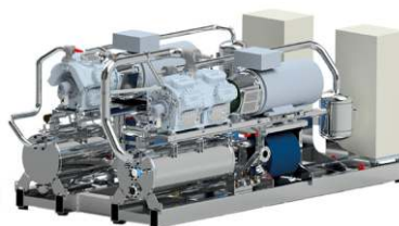
Two-stage SABROE DualPAC TM heat pumps, up to 2500 kW