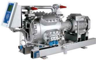
SABROE CMO reciprocating compressor units, 100-270 m3/h