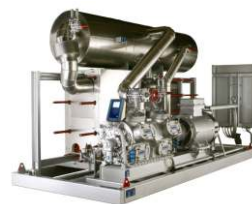
SABROE PAC chillers, 50-1400 kW