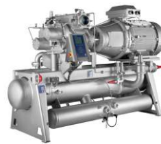
SABROE Sab screw compressor units, 200-1000 m3/h