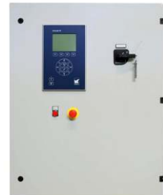
SABROE Y/D starter fixed-speed drive panel