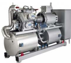
SABROE ChillPAC chillers, 116 - 1398 kW