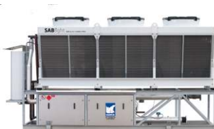
SABROE SABlight air-cooled chillers, 174-430 kW