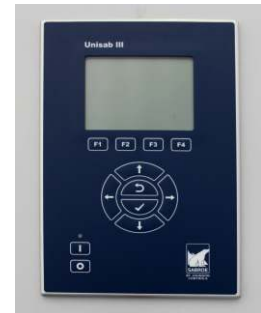
SABROE Unisab III controller