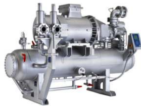
SABROE Sab CO2 high pressure screw compressor units, 100-4200 m3/h