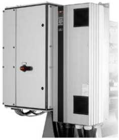
SABROE variable-speed drive panel