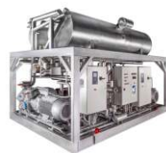
SABROE CAFP CO2/ammonia freezers, 100-800 kW