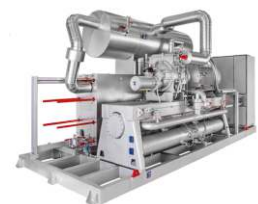
SABROE PAC chillers, 100-6200 kW