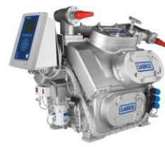
SABROE HPO/HPC/HPX high pressure reciprocating compressor units, 100-450 m3/h.