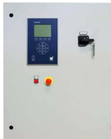
SABROE softstarter fixed-speed drive panel