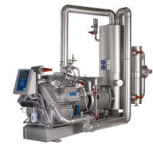
Two-stage reciprocating compressor units SABROE TCMO / TSMC