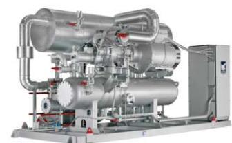
SABROE large non-standard heat pumps, up to 13 000 kW